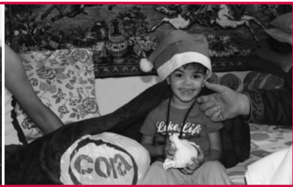
Un foarte Merry Crăciun și un an nou fericit, liniștit!

P.O. Box 26162, USPS Allingtown Branch 75 Farwell Street, West Haven, CT 06516-9998